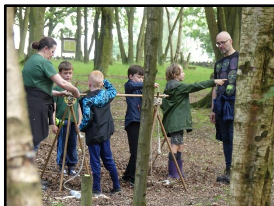
21 st Cubs doing a Dragon's Den challenge trying to build a camp gadget.