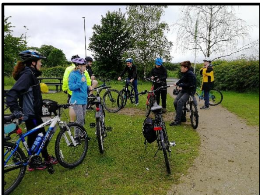
Apocalypse ESU on a bike ride around Ilkeston and Shipley Park.