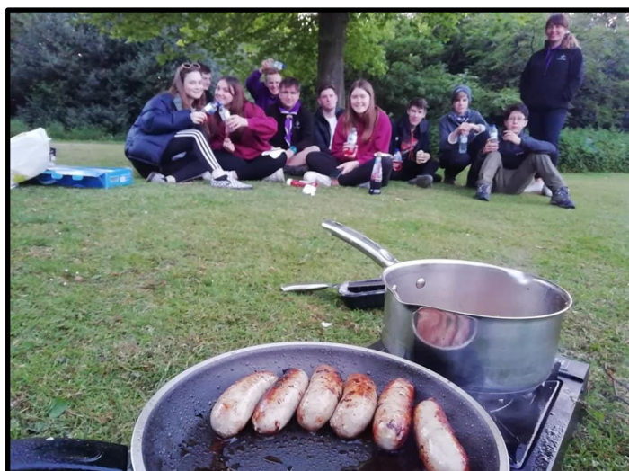
Voyager ESU enjoying hot dogs after an evening at Mapperley Reservoir.