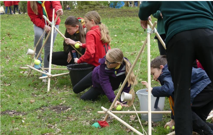
Scouts from 16 th Ilkeston having fun with homemade catapults.

Scouts of all ages had a brilliant morning celebrating St George's Day at Drum Hill. The annual event took on a slightly different format this year with a fun-filled morning of activities ranging from hook-a-duck to a graffiti wall.