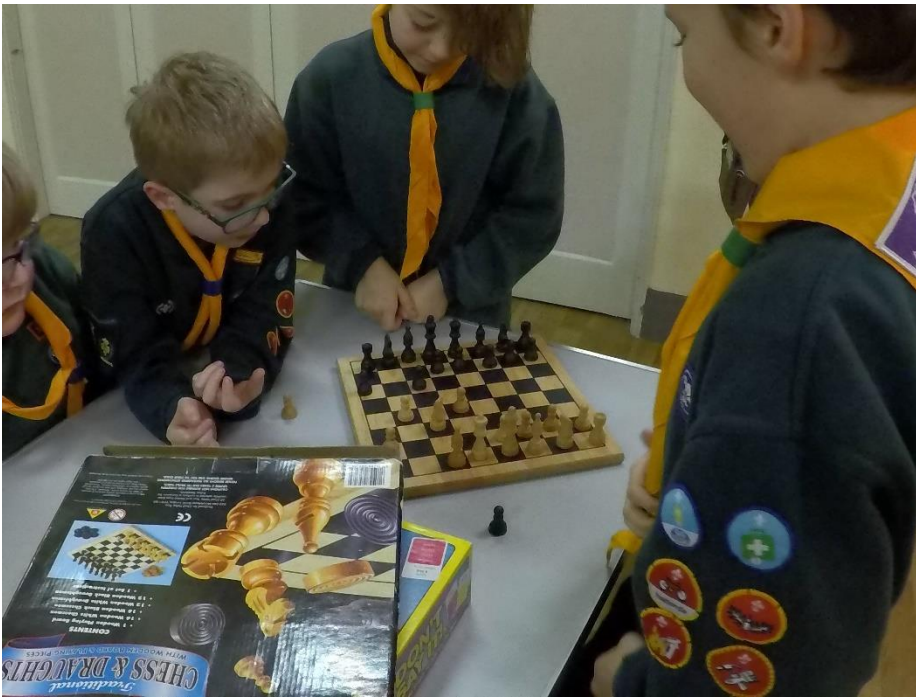
Cubs from 21 st Ilkeston enjoying a game of chess.