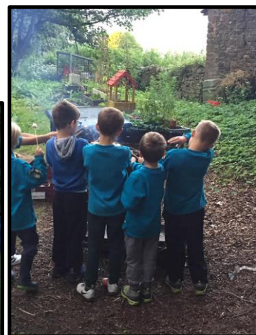
8 th Ilkeston Beavers toasting marshmallows after a fun day of activities.