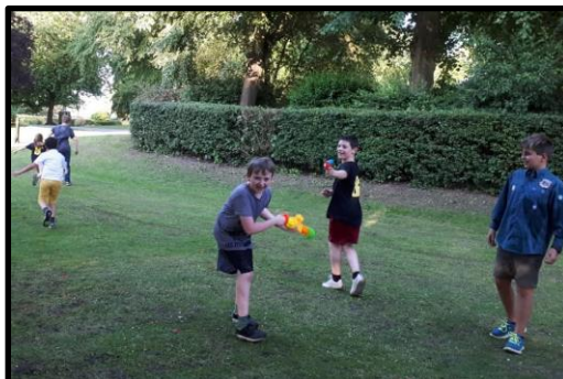
8 th Ilkeston Cubs and Scouts cooling off from the hot weather at Victoria Park.